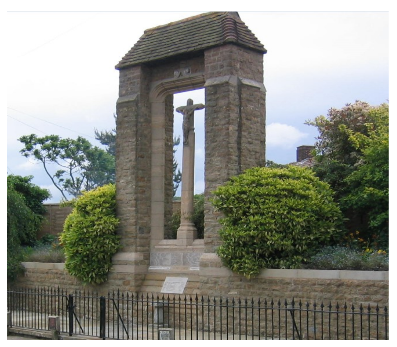
DITTON WAR MEMORIAL AFTER IT HAD BEEN PROFESSIONALLY CLEANED IN 2010