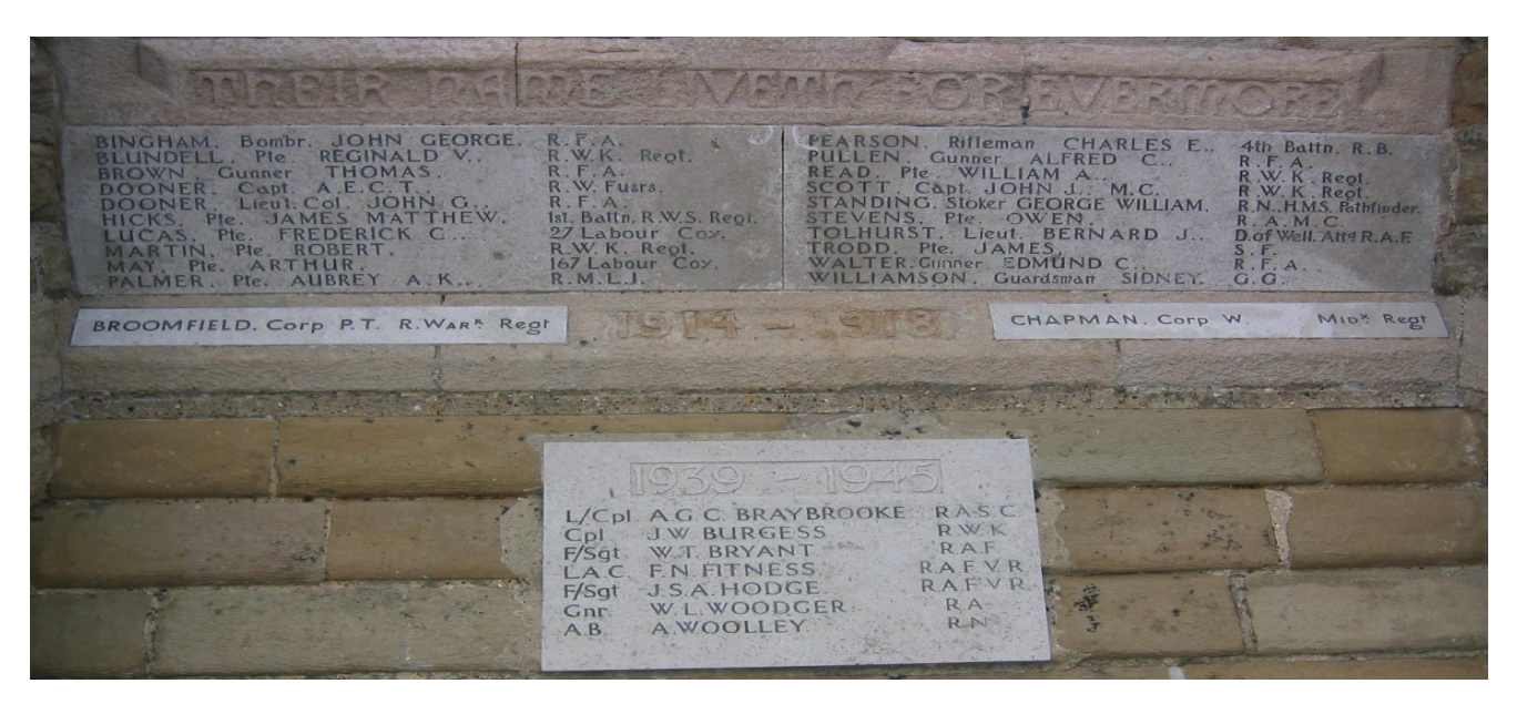
[References for article page 5]