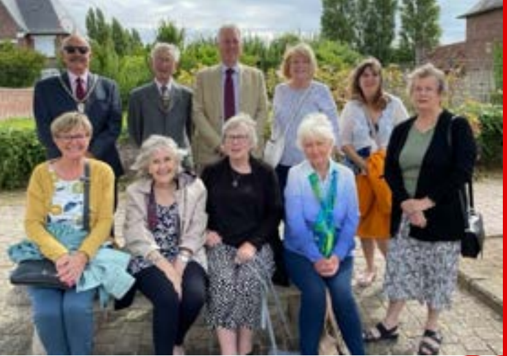
DPC & TWINNING ASSOC.

We are hoping to arrange for Ditton Pétanque Club to visit Rang-du-Fliers for the annual twinning pétangue match this September. The Twinning Association committee is also organising a quiz night at the Ditton Community Centre on Saturday 30th September. Further information will be published nearer the time, but please think about bringing a team. It is always a good evening.